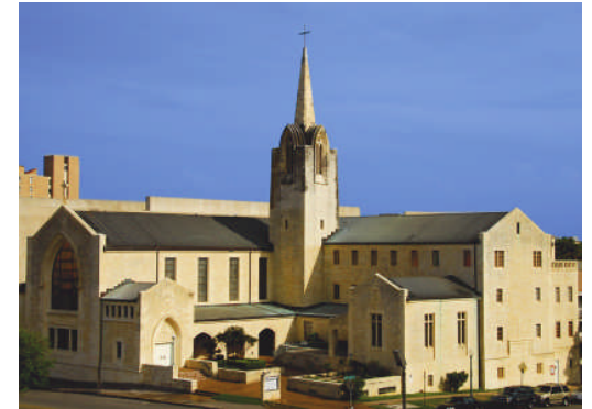
Location of University Christian Church